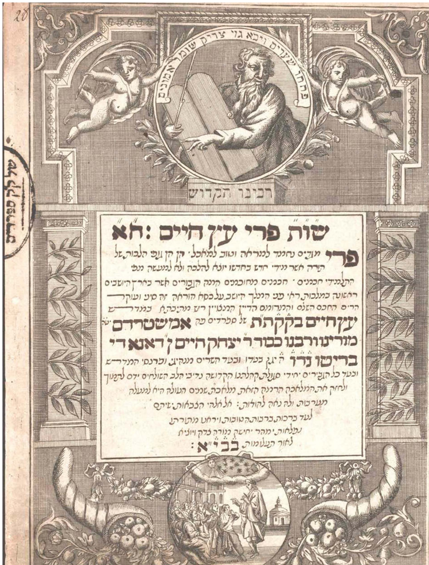
Figure 4. Title page, Peri 'Ets Hayim (Fruit of the Tree of Life). Image provided by Ets Haim—Livraria Montezinos, Amsterdam (EH 4 F 8). For much of the eighteenth century, the Ets Haim Yesiba annually published twelve or thirteen halakhic essays ( pesakim ) composed by advanced students in the Medras Grande .